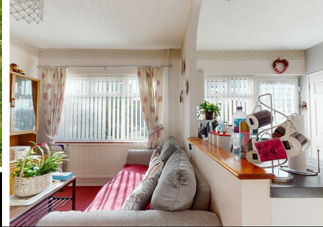
Bittle Mead, Hartcliffe